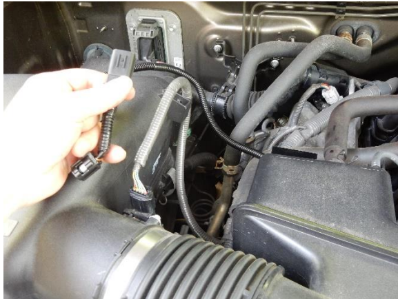
Figure 4 - Connect the IAT/MAF Sensor Harness

5) Route the bypass module's IAT harness (Black Connectors) to the front of the air box. Disconnect the IAT/MAF sensor and connect the module's IAT Harness to the factory connector and IAT/MAF sensor. Secure any loose harnesses out of the way with zip ties.