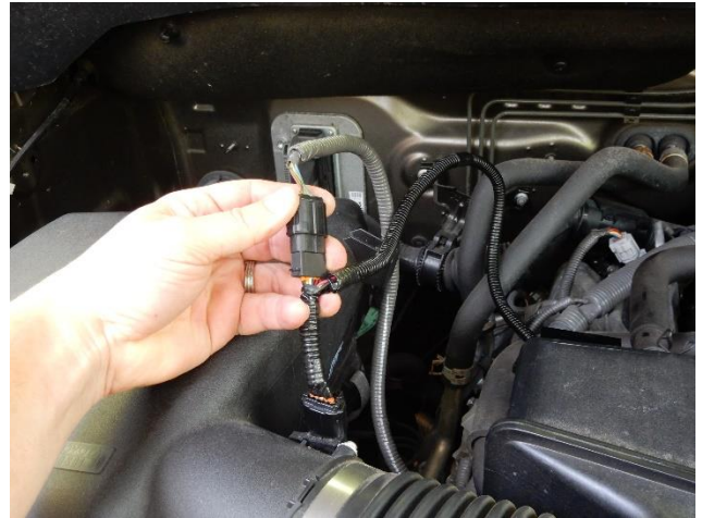
Figure 5 - IAT/MAF Harness Connected

6) Connect the starter relay wire to the module's ¼" quick disconnect terminal and route the wire along the engine wire harness to the fire wall and to the fuse box. The starter relay wire can be installed in wire loom or simply zip tied along the fire wall to an entry point in the fuse box. To get the starter relay wire into the fuse box a notch can be cut in the edge of the box or it can be routed through an existing hole.