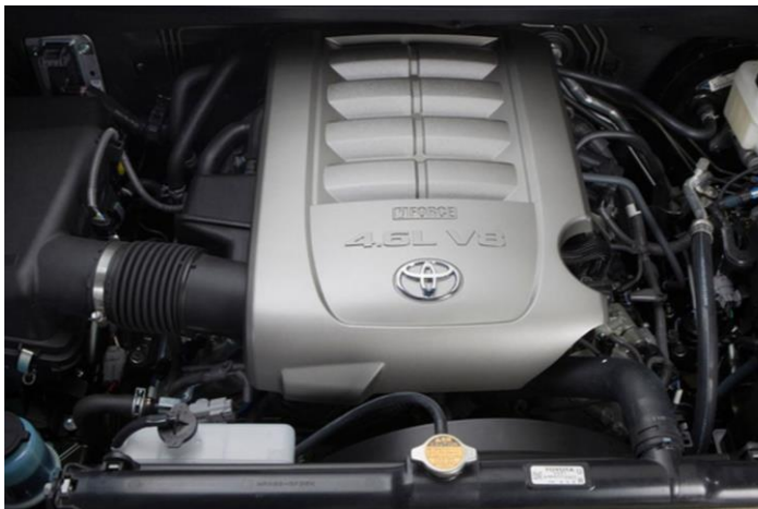
Figure 1 – Intake/Cover Removal