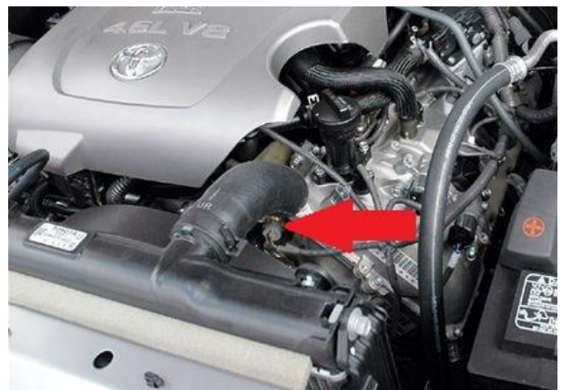
Figure 2 – ECT Sensor Location