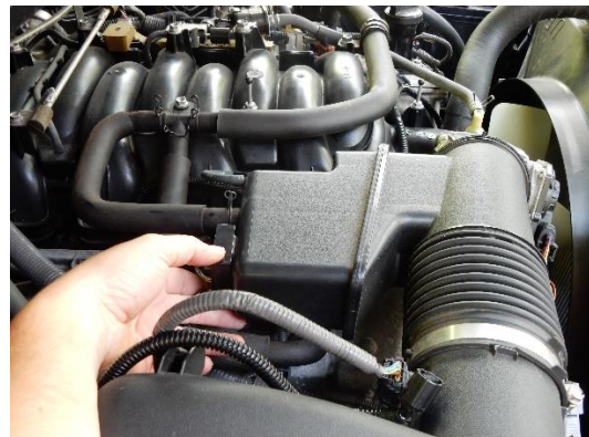
Figure 3- Module Mounting Location