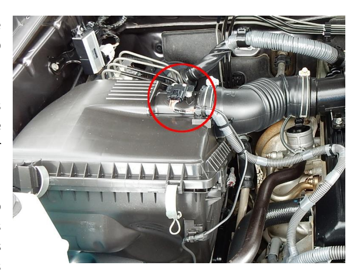
Figure 1 - MAF/IAT Sensor