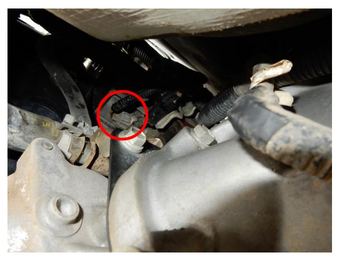
Figure 5 - ECT Connector at back of engine above starter