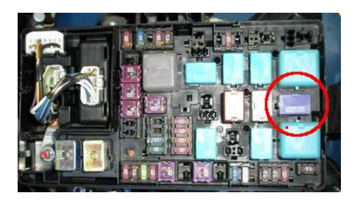
Figure 6 - Starter Relay Circled (labeled ST or STA on lid diagram)

9) Connect the starter relay wire's quick disconnect terminal to the quick disconnect stud on the bypass module and route the wire along with the ECT harness or the firewall to the fuse box that contains the violet starter relay. The starter relay wire can be installed in wire loom or simply zip tied along the fire wall to an entry point in the fuse box. To get the starter relay wire into the fuse box a notch can be cut in the edge of the box or it can be routed through an existing hole.