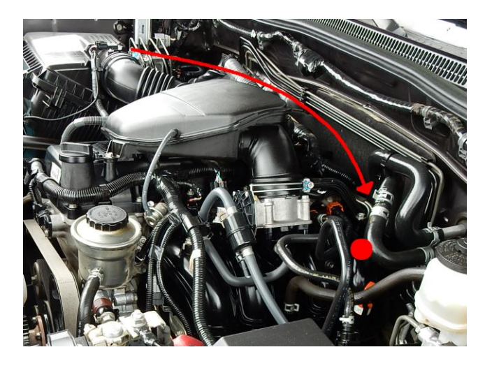
Figure 2 - ECT Sensor Location