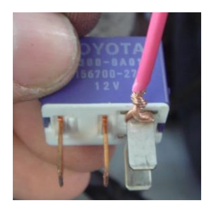
Figure 7 - Starter Signal Wire Taped onto ECU Leg of Starter Relay