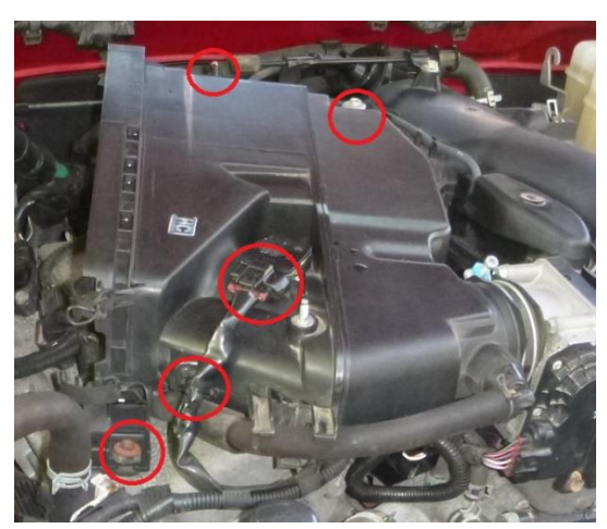
Figure 2 - Disconnect MAF/IAT from factory harness and remove the harness mount, mounting bolts and vacuum line.