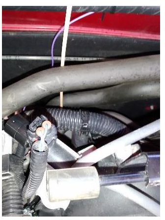
Figure 4 – Locate the ECT connector at the back of the engine. Shown by dowel.