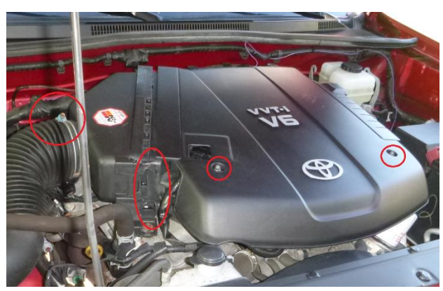
Figure 1 - Intake/Cover Removal

1) Disconnect the air intake tube from the filter housing using a 10mm socket/nut driver or Philips screwdriver. Remove the air filter housing by undoing the housing latches. Remove the intake cover by removing the two nuts that hold it down in the front. Lift the front of the cover up and pull forward to remove.