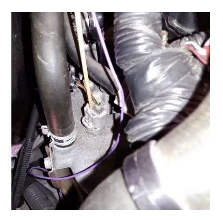
Figure 5 - View of ECT Sensor from Passenger Side Firewall

5) Connect the starter relay wire to the module's quick disconnect terminal and route the wire along with the ECT harness towards the firewall and fuse box. The starter relay wire can be installed in wire loom or simply zip tied along the fire wall to an entry point in the fuse box. To get the starter relay wire into the fuse box a notch can be cut in the edge of the box or it can be routed through an existing hole.