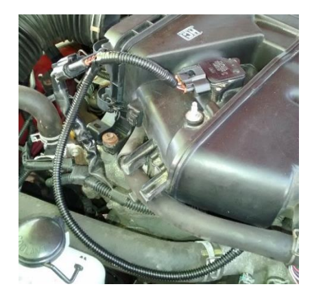
Figure 8 - Connect the IAT/MAF Sensor Harness

7) Route the bypass module's IAT harness to the front of the engine and reinstall the air box (don't forget the vacuum line on the back). Connect the factory IAT/MAF connector and sensor to the bypass module's IAT/MAF harness. The factory IAT/MAF harness can be tucked under the intake towards the SAISBM so only the bypass module's IAT/MAF harness can be seen going to the sensor. Secure loose harnesses out of the way with zip ties.