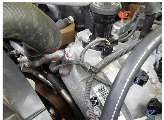
Figure 2 - Disconnect ECT Harness.