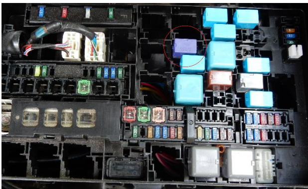
Figure 6 - Example Fuse/Relay Label and Starter Relay Location for a 5.7L Tundra DC - Location and Type May Vary

6) Connect the starter relay wire to the module's 1/4" quick disconnect terminal and route the wire along the engine wire harness to the fire wall and to the fuse box. The starter relay wire can be installed in wire loom or simply zip tied along the fire wall to an entry point in the fuse box. To get the starter relay wire into the fuse box a notch can be cut in the edge of the box or it can be routed through an existing hole.